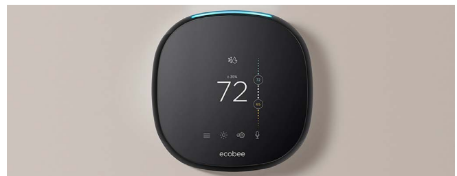
The ecobee smart thermostat is one of the internet-connected devices that North Carolina's electric cooperatives offer to their member-owners to help them manage their energy use.