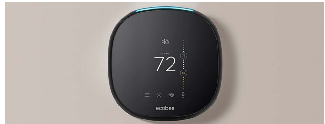
The ecobee smart thermostat is one of the internet-connected devices that North Carolina's electric cooperatives offer to their member-owners to help them manage their energy use.