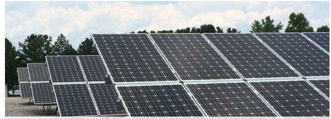
The Community Solar Farm at the Pee Dee Electric headquarters in Wadesboro, NC offers members the opportunity to purchase the energy output from solar panels.