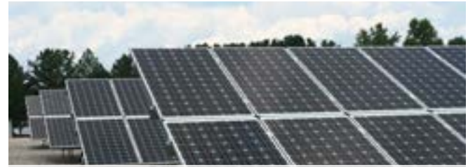
The Community Solar Farm at the Pee Dee Electric headquarters in Wadesboro, NC offers members the opportunity to purchase the energy output from solar panels.