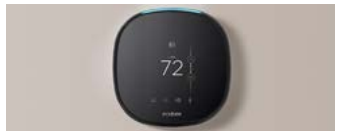
The ecobee smart thermostat is one of the internet-connected devices that North Carolina's electric cooperatives offer to their member-owners to help them manage their energy use.