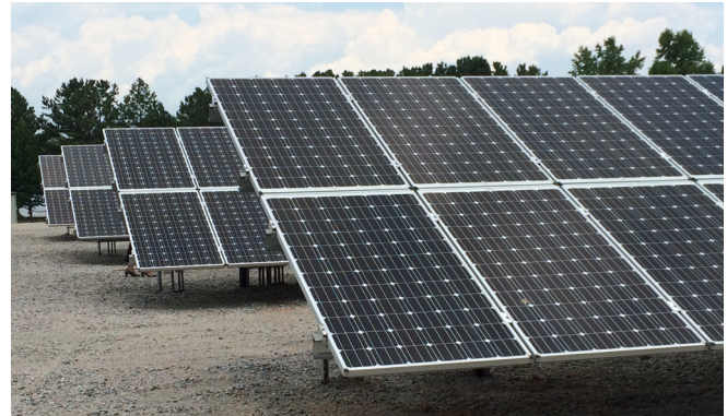
The Community Solar Farm at the Pee Dee Electric headquarters in Wadesboro, NC offers members the opportunity to purchase the energy output from solar panels.