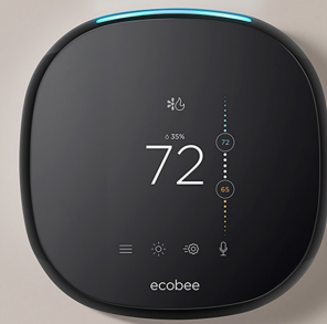
The ecobee smart thermostat is a one of the internet-connected devices that North Carolina's electric cooperatives offer to their member-owners to help them manage their energy use.

As member-owned, not-for-profit businesses, North Carolina's electric cooperatives will continue to innovate and connect with members in ways that match local needs and expectations.