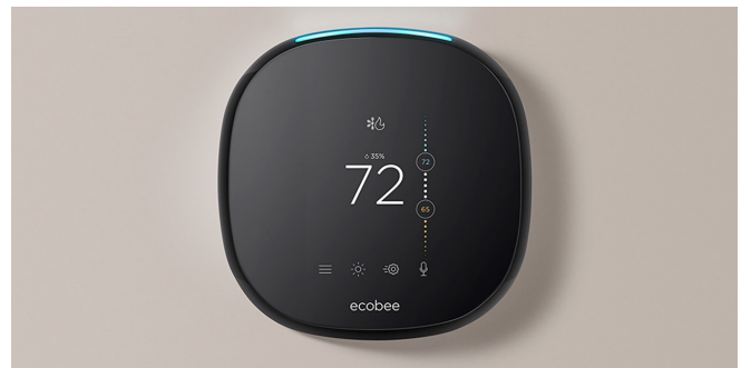
The ecobee smart thermostat is a one of the internet-connected devices that North Carolina's electric cooperatives offer to their member-owners to help them manage their energy use.

As member-owned, not-for-profit businesses, North Carolina's electric cooperatives will continue to innovate and connect with members in ways that match local needs and expectations.